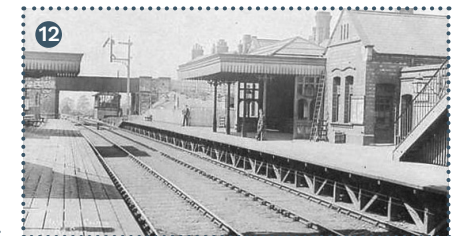
HARE PARK STATION

13. Nostell: Nostell Railway Station was opened on 1 February 1866 and was used by the Great Northern Railway and the Manchester, Sheffield & Lincolnshire Railway on the line from Doncaster to Wakefield. The station closed October 1951 and has been demolished.