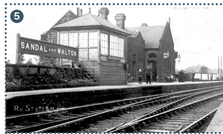
SANDAL AND WALTON

Opened 1 June 1870 by the Midland Railway on the line from Derby to Leeds. The station was in central Walton, accessed off School Lane, close to the junction of Green Side and Oakenshaw Lane. Renamed Walton on the 30 September 1951 but closed on 12 June 1961. Subsequently demolished and the site became a private garden.