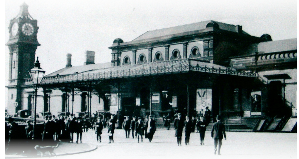
WESTGATE RAILWAY STATION