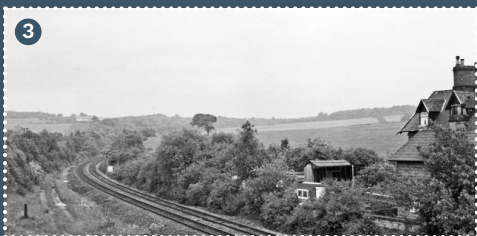
CRIGGLESTONE WEST (SITE OF)