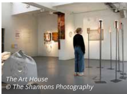
The Art House

Round off your day with dinner and drinks at one of Wakefield's independent eateries and bars, then catch a show at Theatre Royal Wakefield or a live event at WX .