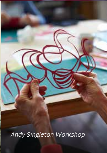
Andy Singleton Workshop