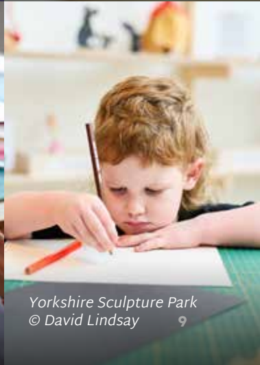
Yorkshire Sculpture Park