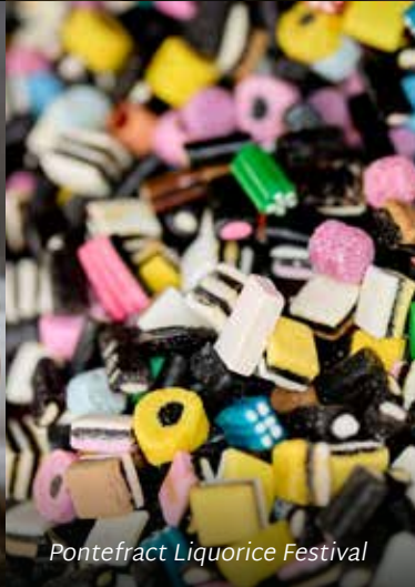
Pontefract Liquorice Festival