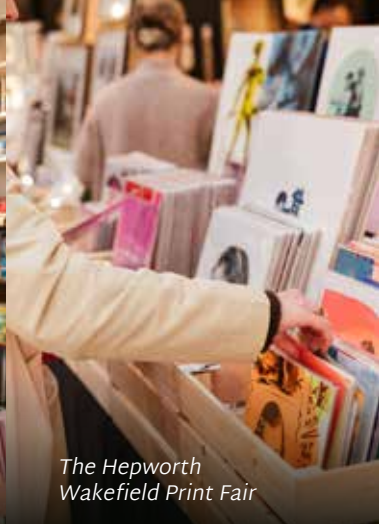
The Hepworth Wakefield Print Fair