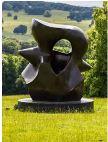
Henry Moore, Large Spindle Piece , 1968. Courtesy of the Henry Moore Foundation. Photo courtesy Yorkshire Sculpture Park

Round off your day in true Yorkshire style: sink into the warmth of a cosy country pub before retreating to your hotel for a relaxing evening.