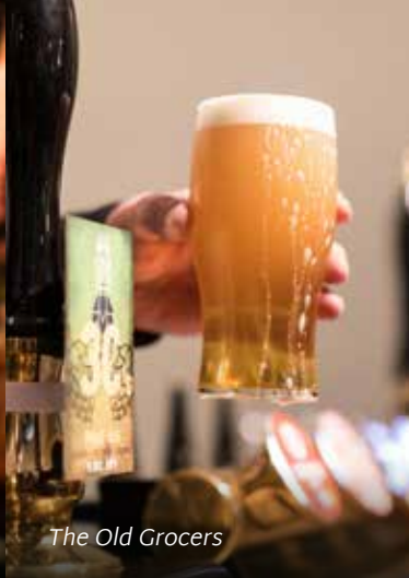
The Old Grocers