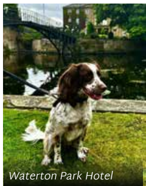
Waterton Park Hotel

If you're a rover, the Wakefield district is the paw-fect place. Wander the waterside and flat, easy walking paths of our beautiful country parks: Anglers , Pugneys and Newmillerdam . Tail-wagging adventures await at Haw Park Wood , Notton Wood and Horbury Lagoon , while National Trust Nostell and Yorkshire Sculpture Park offer a wide variety of landscapes to discover, along with a slice of culture.