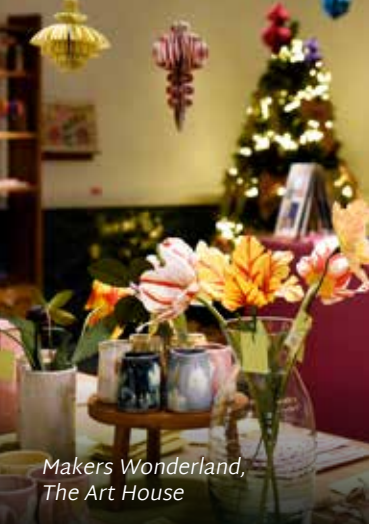
Makers Wonderland, The Art House