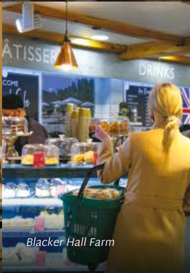
Blacker Hall Farm