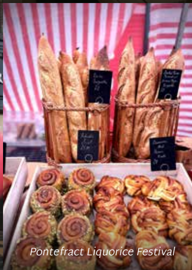
Pontefract Liquorice Festival