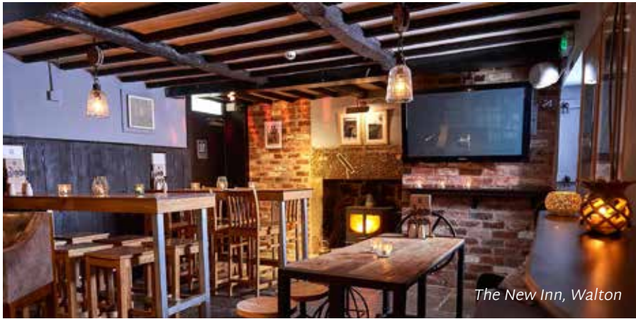
The New Inn, Walton