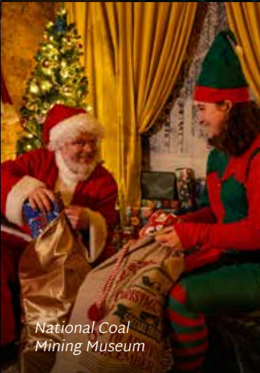
National Coal Mining Museum