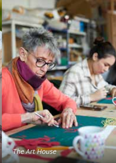
The Art House