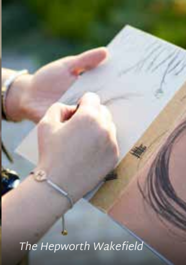
The Hepworth Wakefield