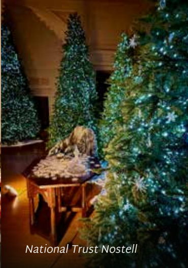
National Trust Nostell