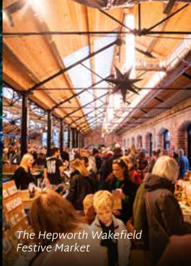
The Hepworth Wakefield Festive Market