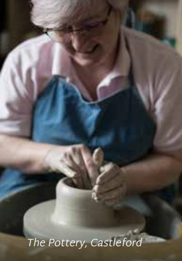
The Pottery, Castleford