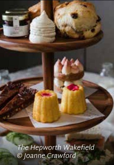
The Hepworth Wakefield