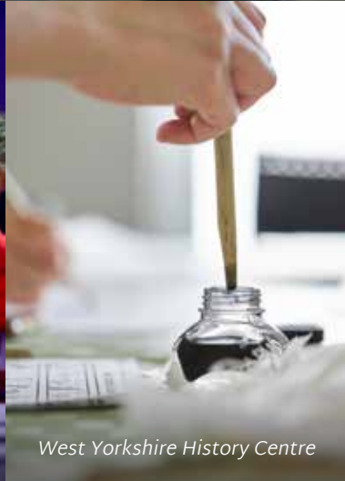
West Yorkshire History Centre