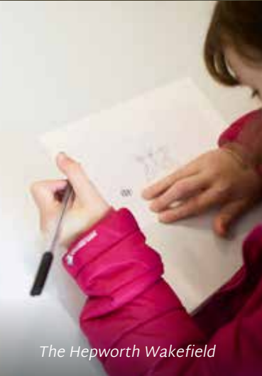
The Hepworth Wakefield